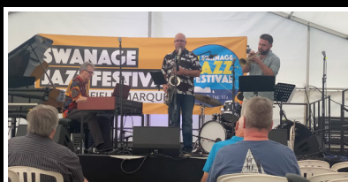
"Rhythm Schtick" Live