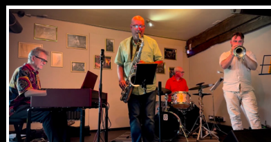
"Wheeling and Dealing" Live