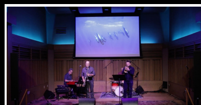
"Oceanic Part II - Diversity" Live